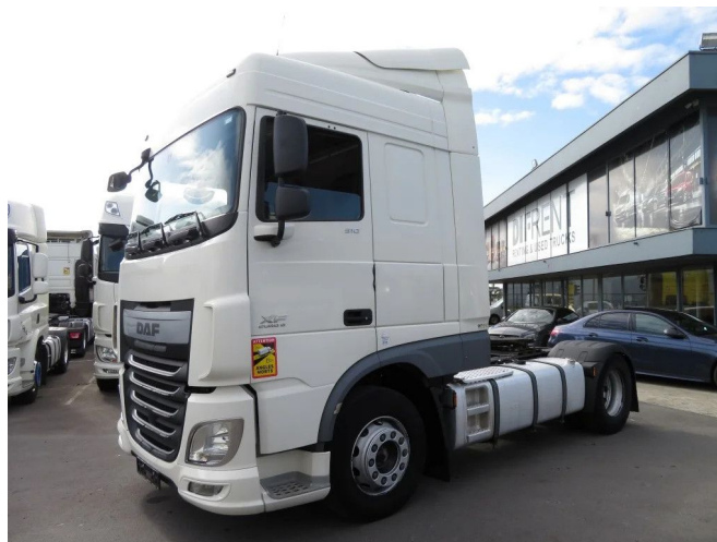
DAF XF 510 FT SPACE CAB