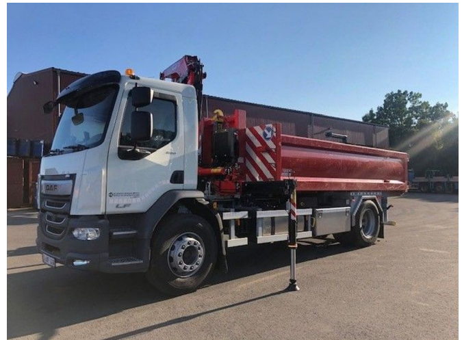
DAF LF 290 Fassi F120B.2.23 E-Dynamic + TAM T12 4x2

Referentienummer: 2AXF416 - 0L506803 - CHW KR 12